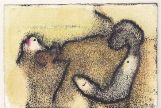
Creation Song By Denise Owen