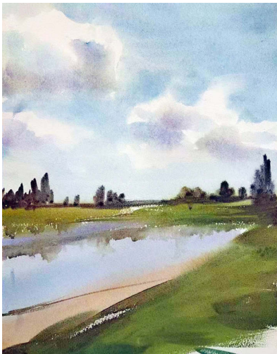
“Sacramento River” by Dongfeng Li