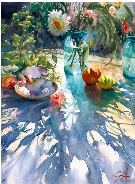
“Curses and Blessings” by Geoff Allen

About the Workshop: In this plein air workshop, David will share his methods for mastering watercolor timing—knowing when the paper is wet enough but not too wet, or when it’s the right moment to add the next wash, and mixing colors directly on the paper, so that they melt into one another. We will begin with a half-day demonstration in the SFAC studio and then move to a nearby location (TBD). The second day will be entirely on location and wrap up with a critique of your work. Students will receive personalized feedback and tips tailored to your skill level, helping you develop your own voice in watercolor.