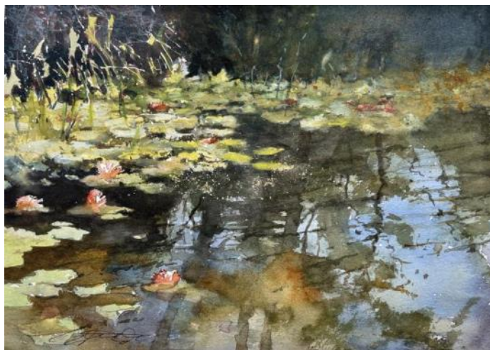
Starfield Pond - Steve Stein